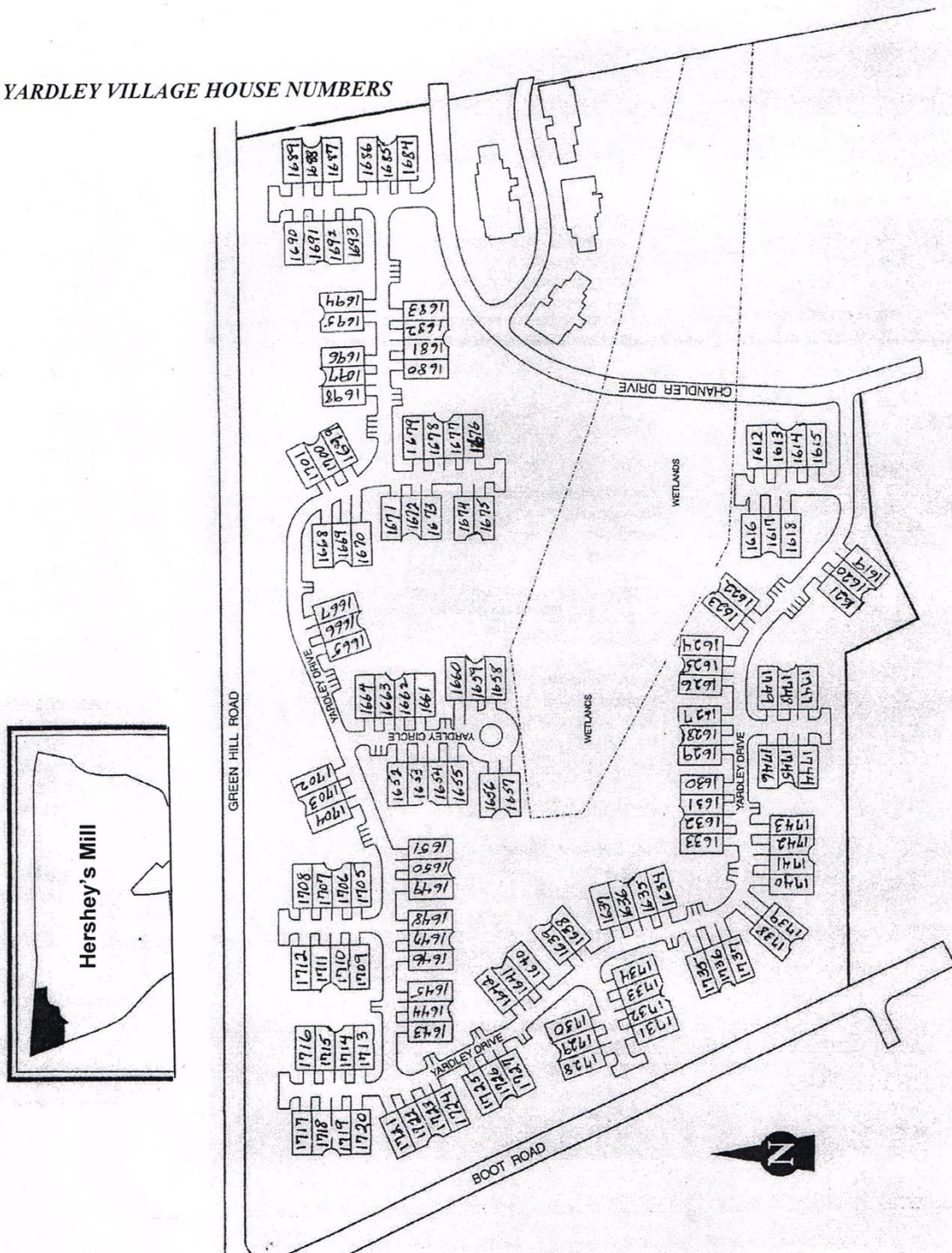
C. YARDLEY VILLAGE HOUSE NUMBERS