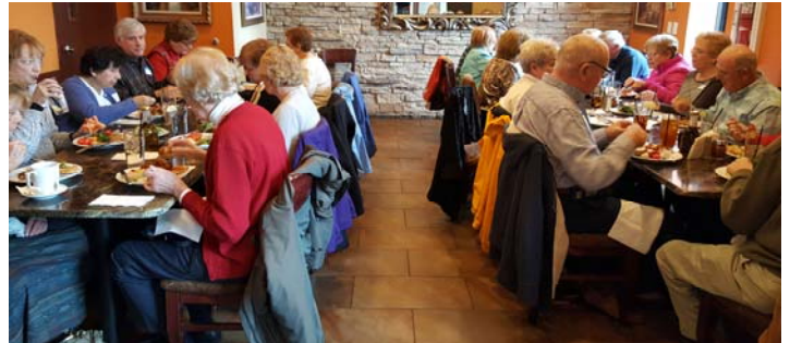
Above: The Lunch Bunch dine at Limoncello's in Chester Springs Nov. 13. Below: Jefferson Village Ice Cream Social at the Community Center, Sept. 14

Please join us. It's a great way to meet your neighbors.