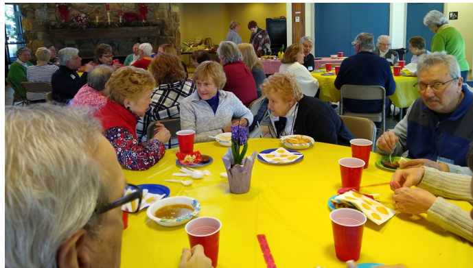
Just a few of the "souped up" Jeffersonians at the Feb. 9 Souper-Bowl Party

Mark your calendars for the upcoming JV Theme Dinner which will be held on Friday, June 12th at the Community Center. More information will be provided closer to the event. Watch for a flyer in May with details.