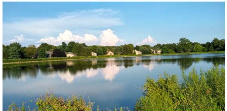
Jefferson Village across from the HM Lagoon on a beautiful summer day!