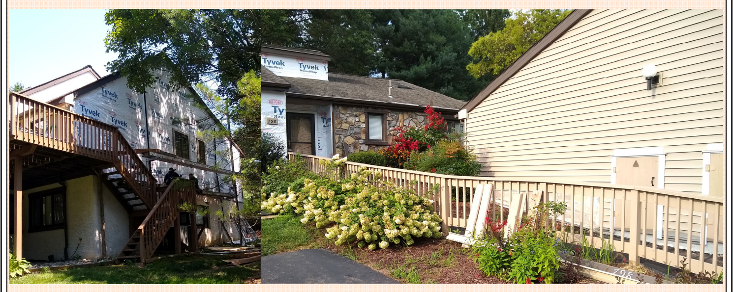
It's Finally Happening—The Village Siding Project Has Begun!

A Newsletter for the Residents of Jefferson Village—The Heart of Hershey's Mill