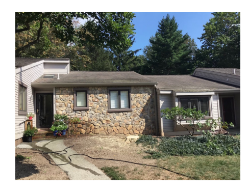
The destructive combination of eroded foundation grading and elevated planted areas in front of roof drip zones is causing wet basements for some villagers. 772, 773 and 776 had trees removed to allow regrading now and appropriate replanting in early spring. BS Landscaping contract.

Respectfully submitted, Barbara Crispin Landscaping Chair