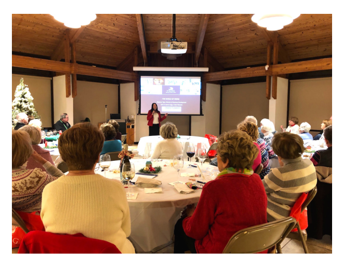
Viking Rep discusses Paris to Swiss Alps river cruise planned for April 2023

The first meeting of the ITC was Dec. 3, 2021 and the excitement and interest were evident with 30 in attendance. We enjoyed presentations from Rocky Mountaineer , the Canadian Rockies luxury train and Viking Cruises , the much awarded worldwide river, ocean and expedition cruise line.