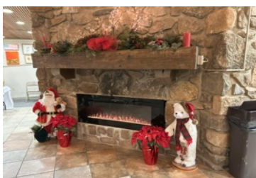
Our beautifully decorated Christmas Fireplace