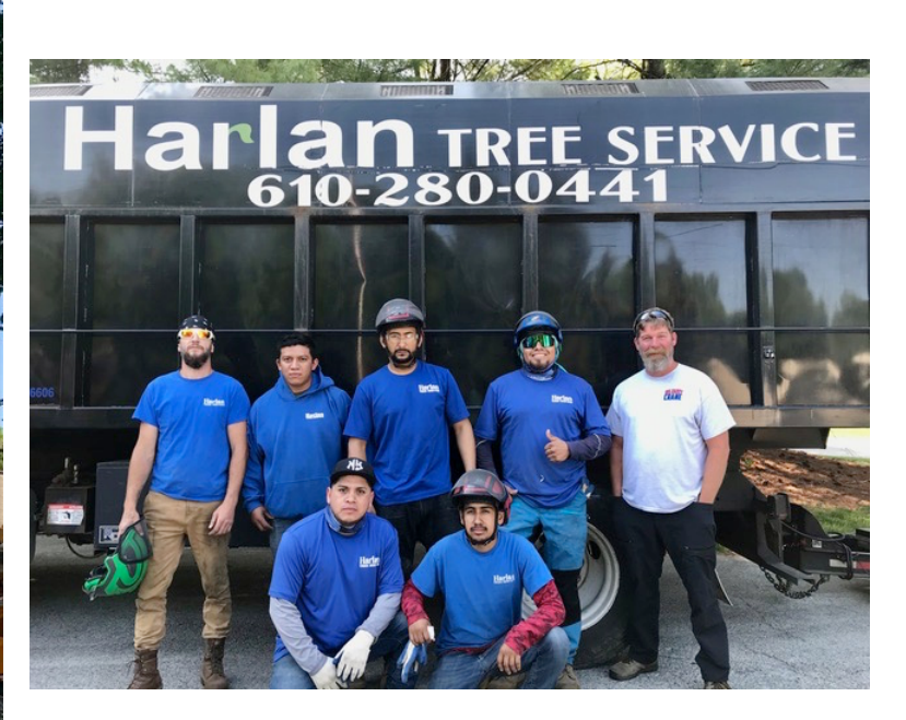
Harlan Tree Service crew did an efficient job getting it out in sections. They do an excellent job every time they come.