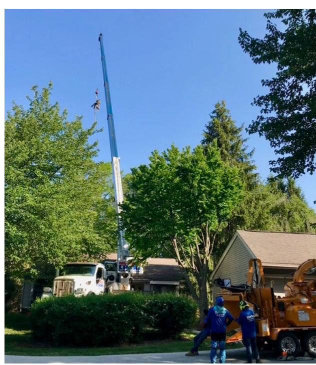
The declining red oak came from the back of 739. Anyone want to take the place of the guy hanging on to the hook?