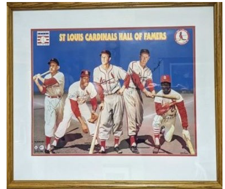
Team picture of St. Louis Cardinals' Hall of Famers