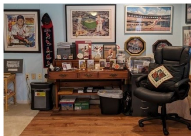
Desk and table with variety of sports memorabilia