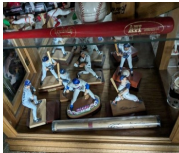
Cabinet with balls and figurines