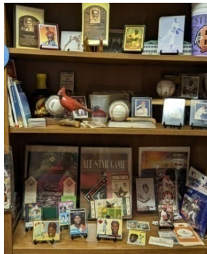
Bookshelf with cards dating back to 1949