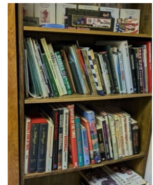
Bookshelf with various sports books