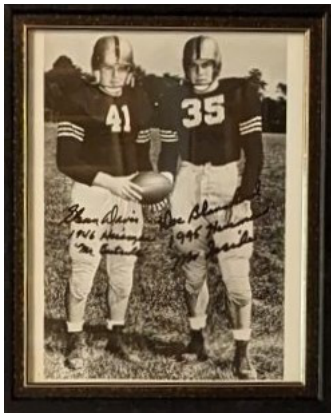
Doc Blanchard & Glen Davis won back-to-back Heisman Trophies