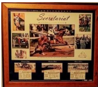
Secretariat Stan Musial Swinging