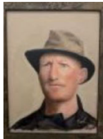
Les (the model) 10"w x 16"h