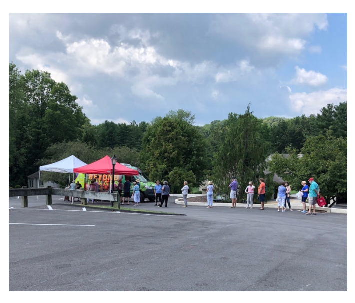
Residents waiting to purchase Simple Suppers (Community Center parking lot)