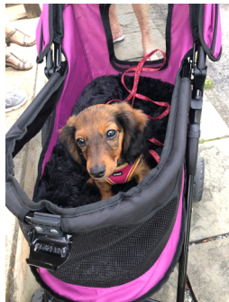
Sweet Pea in her doggie stroller