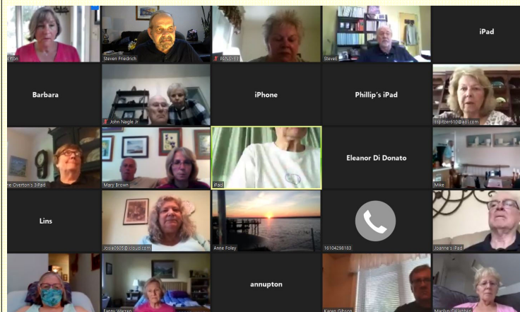
An example of a Zoom meeting screen on May 27

Forced into an online meeting due to coronavirus restrictions, the Spring Open Meeting of Village Council took place online. Attracting over 70 participating monitors and an estimated 100 residents, the meeting went off virtually without a hitch.