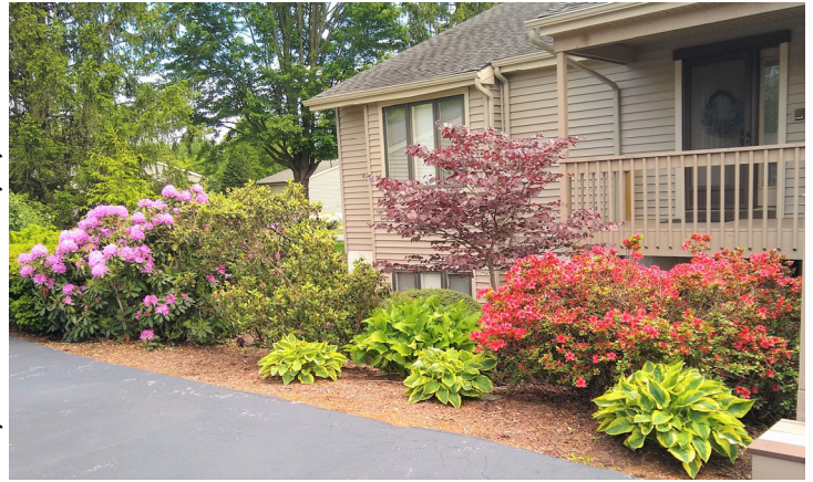
Spring has turned our village into a virtual Garden of Eden