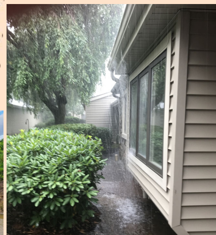
Above: Tropical Storm Isaiahs overwhelms village gutter and drainage systems.