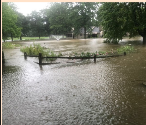
Above: Jefferson Pond overflows first time in village memory. Right: Tropical Storm raises Ridley Creek, flooding swale next to the Lagoon.