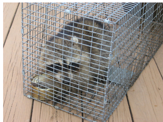
The furry culprit, caught on my deck!

A neighbor's birdfeeder behind my place attracted a raccoon family—adults and several juveniles. The feeder was on a tall pole. One day a raccoon with his little hands managed to climb up and into the seed holder. He gorged on the seeds, ate them all, his tummy swelled and he got stuck. The feeder owner and another neighbor heard him struggling to get out and managed to set him free without being bitten. In the beastly hot, continuing heat wave that summer of 2013, the raccoons continued to feed happily on seeds under the bird feeder as well as on a cat food the feeder owner left on the terrace. It's a rare animal that befouls its own feeding spots or living quarters, so these fastidious beasts took to ambling over to my deck where they established a LATRINE—in the angle where the living room door is perpendicular to my sliding glass doors. A LATRINE! Yes, that's what they are officially called, and a raccoon latrine serves the same function as latrines everywhere.