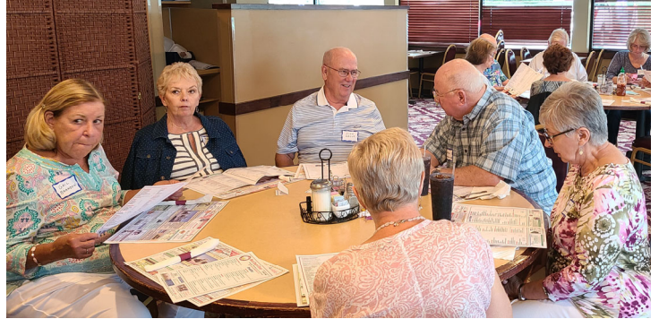
The resumption of Jefferson Village Lunch Bunch gatherings brought over 30 residents out to both July and August events at the West Chester Diner. The next Lunch Bunch will take place in October at McKenzie's in Malvern.