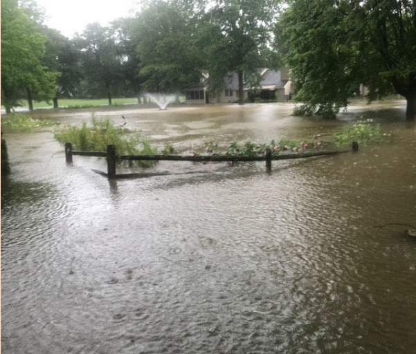
Flooding above, from Tropical Storm Isaias in August 2020 repeated again this summer as Tropical Storm Fred dropped 6.5" of rain in a few short hours last month.

A Newsletter for the Residents of Jefferson Village—The Heart of Hershey's Mill